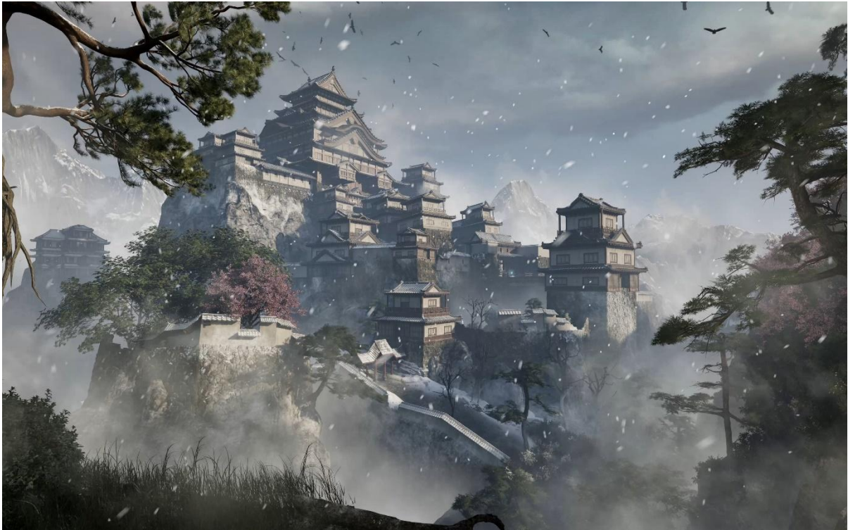
Traditional Japanese Castle: Tenshukaku